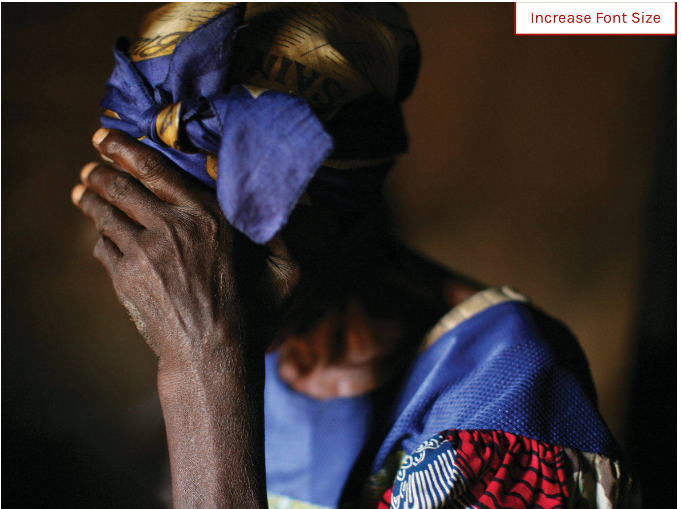
Figure 4.1: Violence against women is a serious and common problem worldwide. Women and children, trafficked for sex and slave labor, are particularly vulnerable in conflict zones. This woman was among hundreds raped when rebels attacked a village in the Democratic Republic of Congo.