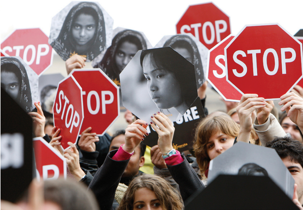
Figure 4.2: Women holding portraits of victims protest violence against women in Milan, Italy.

International research, conducted over the past two decades by the World Health Organization and others, reveals that violence against women is a much more serious and common problem than previously suspected. It is estimated that one out of three women worldwide has been raped, beaten or abused. While violence against women occurs in all cultures and societies, its frequency varies across countries. Societies that stress the importance of traditional patriarchal practices which reinforce unequal power relations between men and women and keep women in a subordinate position tend to have higher rates of violence against women. Rates tend to be higher in societies in which women are socially regulated or secluded in the home, excluded from participation in the economic labor market and restricted from owning and inheriting property. It is more prevalent where there are restrictive divorce laws, a lack of victim support services and no legislation that effectively protects female victims and punishes offenders. Violence against women is a consequence of gender inequality, and it prevents women from fully advancing in society.